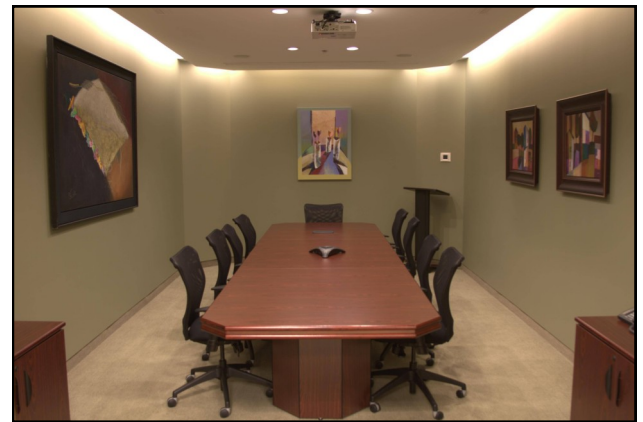
Bay Boardroom (14 people)