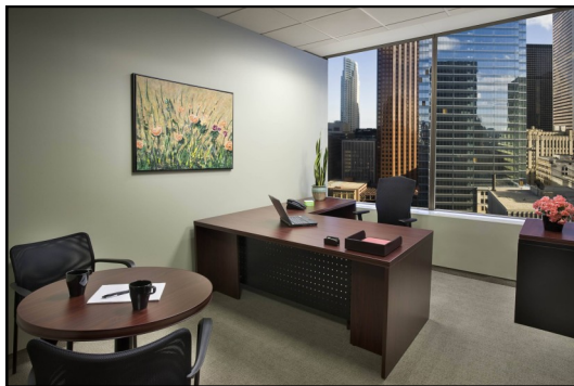
Day Office—Furnished with Phone / Internet