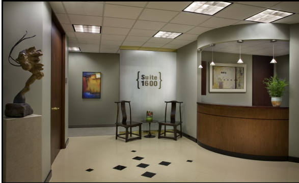
401 Bay Centre Reception