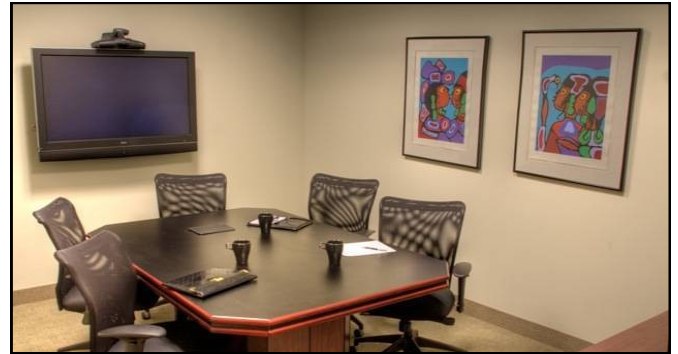
Queen Meeting Room (6 people)